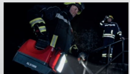
Portable hand lamp en route to the scene