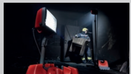
Work stations lighting