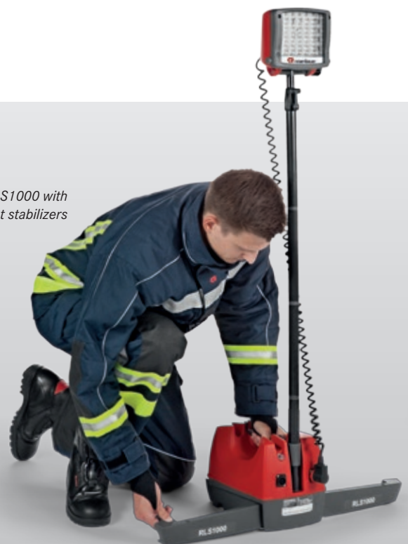
RLS1000 with fold-out stabilizers

The integrated extension poles with quick lock system (quick-release device) allow the light head to be set at different heights, up to a maximum of 1.80 m. The main advantage: an additional tripod and extension cord are no longer necessary. Fold-out stabilizers ensure stability even on uneven surfaces. With the practical carrying handles the floodlight can also be used as a hand lamp, to light the way to the scene, for example.