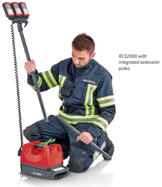
RLS2000 with integrated extension poles.